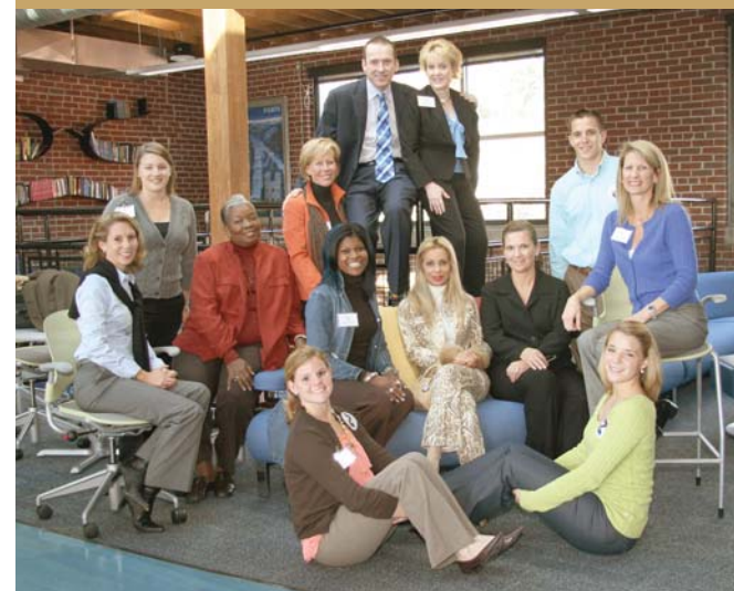
Trainees observe and share teaching moments with the students at Ron Clark Academy, Atlanta, Georgia where the principals of ELI teach an after-school leadership skills class.