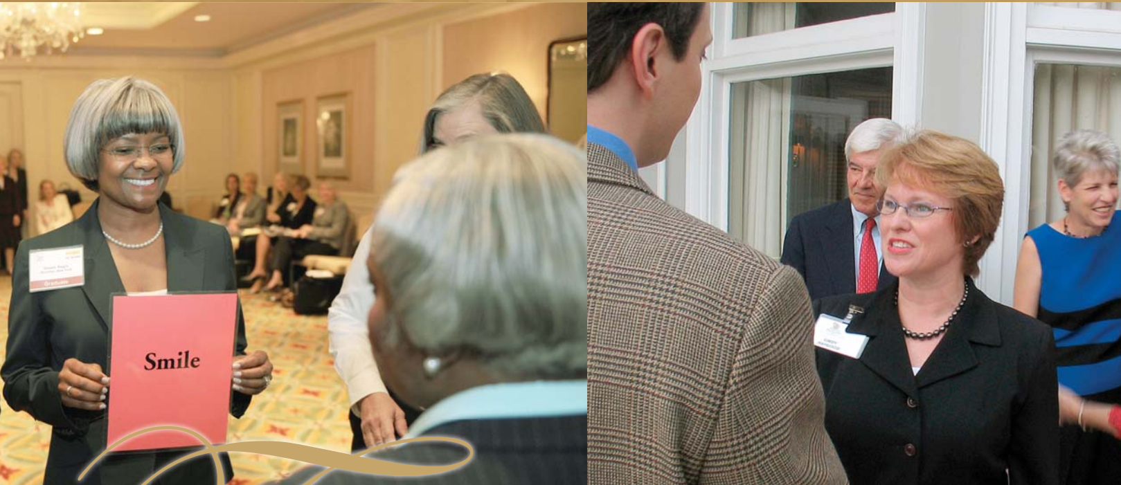
Small group exercises during Children's Etiquette training

The Etiquette & Leadership Institute is the leader in children's etiquette training. We have established a tradition of excellence by providing the most comprehensive children's etiquette training available. Our school is recognized worldwide as the best in the profession. We have invested years to create a team of expert trainers, the best resources in the industry and the highest caliber curriculum. We deliver quality worthy of our name.